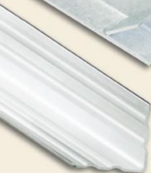
Roll-formed brick lintels