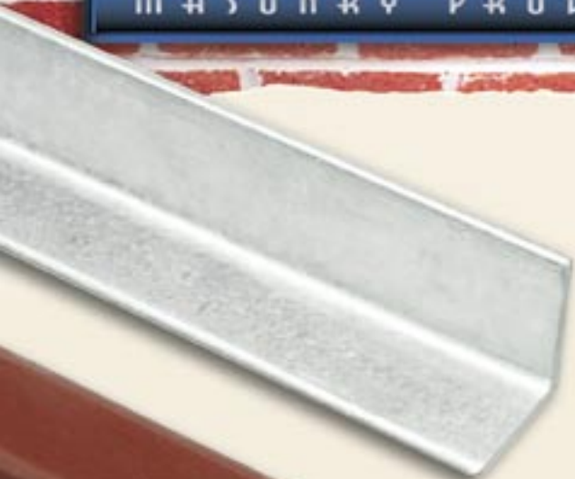
Galvanized angle lintels