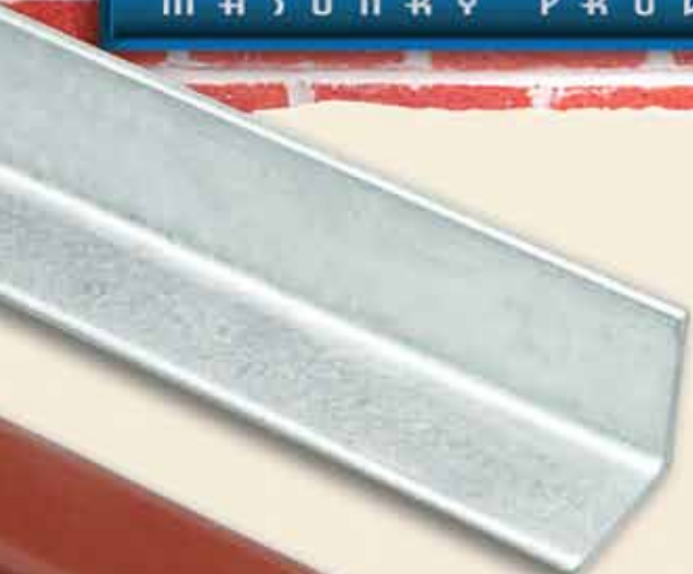
Galvanized angle lintels