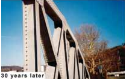
30 years later