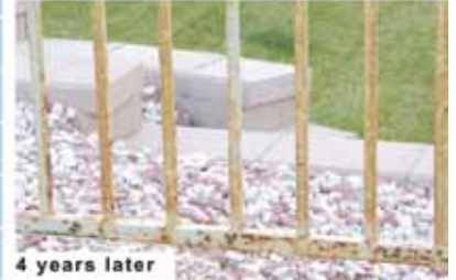
4 years later

Source: American Galvanizers Association