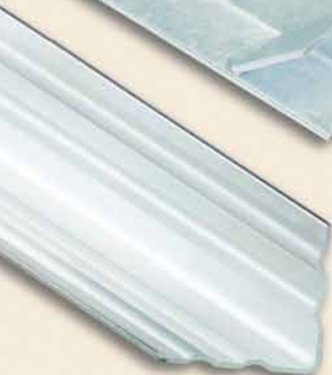
Roll-formed brick lintels